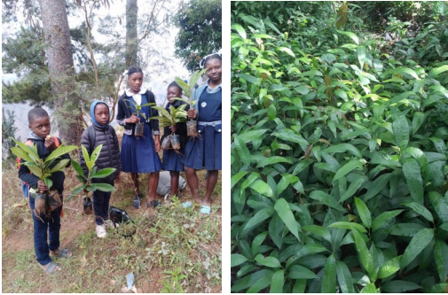
Left: Furcy - Students from Orphanage school with loquat seedlings - April 2022 Right: Vialet - Mango seedlings - July 2022

The nurseries in Vialet and Furcy continued to function with guardians. Small scale farmers, students and a group of midwives received a variety of seedlings. Last year over $3,000 was raised in memory of Michele Chung to help finance this project.