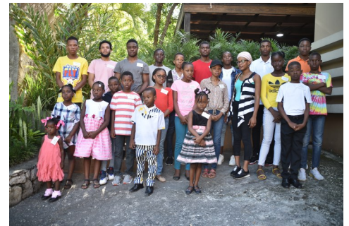
Sponsorship Group 3 on August 20, 2022