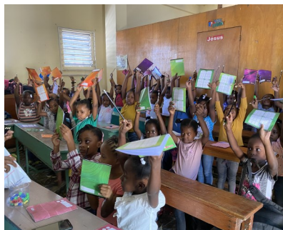
Below: St-François Xavier - Grade 1 students with note book and pencil, on November 30, 2022