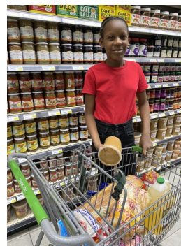
Above: Eldridge shopping, August 27, 2022

The families of 8 students received on a monthly basis the nutrition supplement resulting in improved well-being and better grades. The recipient families are most grateful.