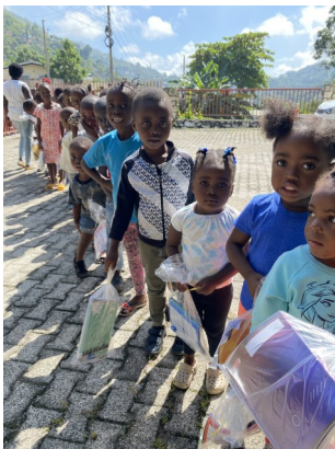
Left: Laboule 12 students with bags of school supplies, on September 1, 2022

Over 753 students received school supplies in 4 locations. These essential tools contribute to the students' success at school.