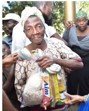
Left: Laboule 12: Distribution of dry goods kits on December 30 Right: Handicapped young man happy to have kit Dec. 24

It was too dangerous to gather and share a meal to celebrate the joy of Christmas. Instead, dry good kits consisting of rice, beans, oil and other basics, were distributed to over 300 people in several locations. The most touching was the distribution of kits in Petionville to people in the streets who were elderly, disabled or begging for money. All were so appreciative to the Foundation for ensuring a small ray of Christmas hope in these dire times.