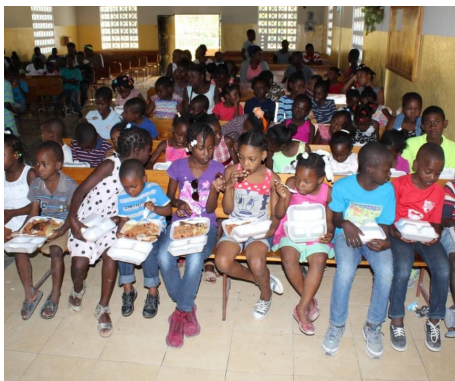
Photo (Above): Children enjoying meal at Malik Nazareen church - Dec. 24, 2019.

Through the generosity of donors and funds raised through the sale of cakes and ice cream, Christmas meals were served from mid to late December. The food delivery to churches and schools was not without its challenges given the current insecurity in Haiti. Nevertheless, over 1,300 needy persons were served: including school children, teachers, street kids and adults. Toiletries, toys and sweets were also distributed to the youngsters, who were thrilled to be remembered with these modest gifts. In remote Savannah, 106 families received dry goods kits and children from kindergarten to grade 3 received small gifts.