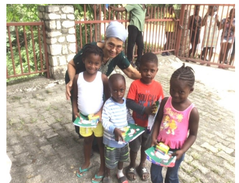
Photo (Above): Distribution of school supplies at Laboule 12 - Aug. 31, 2019.