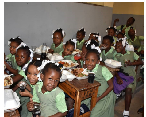
Photo (Above): Joyful Students of Petionville communale School - Dec. 17, 2019.

Through the generosity of donors and funds raised through the sale of cakes and ice cream, Christmas meals were served from mid to late December. The food delivery to churches and schools was not without its challenges given the current insecurity in Haiti. Nevertheless, over 1,300 needy persons were served: including school children, teachers, street kids and adults. Toiletries, toys and sweets were also distributed to the youngsters, who were thrilled to be remembered with these modest gifts. In remote Savannah, 106 families received dry goods kits and children from kindergarten to grade 3 received small gifts.