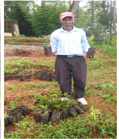
Photo (Above): Elderly man with his choice of seedlings in Furcy - Sept. 9,