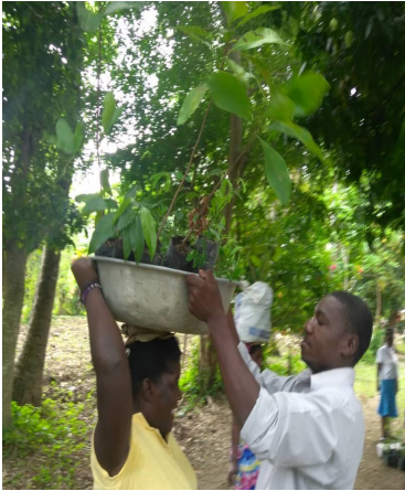
Photo (Above): Help needed to place seedlings on head - Sept. 2, 2019.