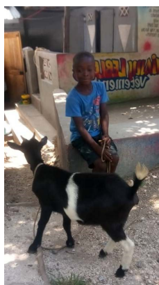
Left : Goat at Fondoux - Aug. 2020

In Fondoux, the Passing-on-the kid Project continues. Children are caring for the kids under their parents' supervision.