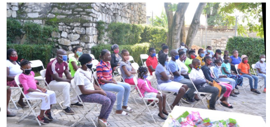
Below: Guardians & sponsorees at Annual meeting - Aug. 22, 2020