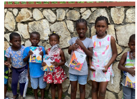
Above: Young people in Laboule 12 on Sept. 19, 2020