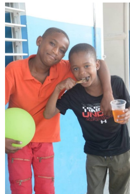
Right: Happy lads: at École La Grotte Dec. 22, 2020