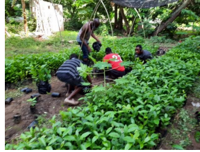
Above: the Vialet nursery, December 2020