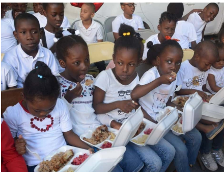
Left: Dec. 23, 2020 - St Pierre - Kids enjoying the meal