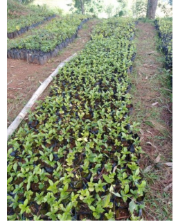
Right: Coffee seedlings in Furcy, on Aug. 26, 2020