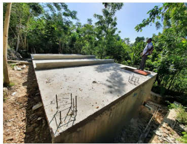
Above: Covered cistern in Savannah - Oct. 3, 2020

Generous donations from The Missouri Annual Conference of The United Methodist Church, St Andrew's Church Ottawa and La Fondation Ernest E. Guertin helped finance the building of a cement slab cover to the cistern and the repair of gutters for the school at Savannah.