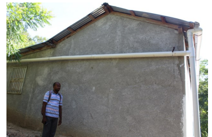
Above: Gutters on Savannah School - Oct. 3, 2020