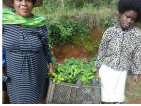
Above: Ladies with coffee seedlings in Furcy,