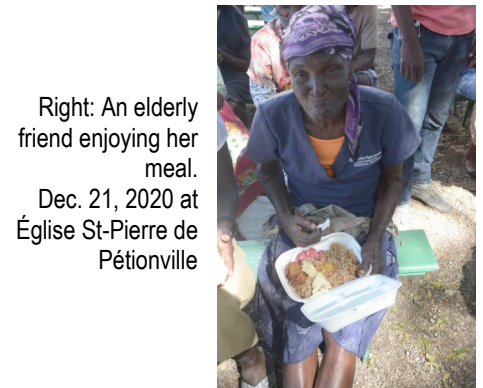
Right: An elderly friend enjoying her meal. Dec. 21, 2020 at Église St-Pierre de Pétionville

It is by the grace of God and your goodwill that we achieved all this in 2020. Please accept our sincere thanks!