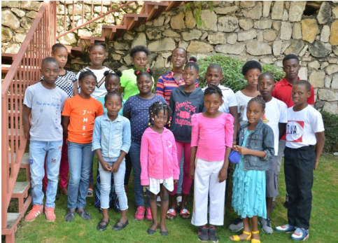
Above: Group of sponsorees - Aug. 22, 2020